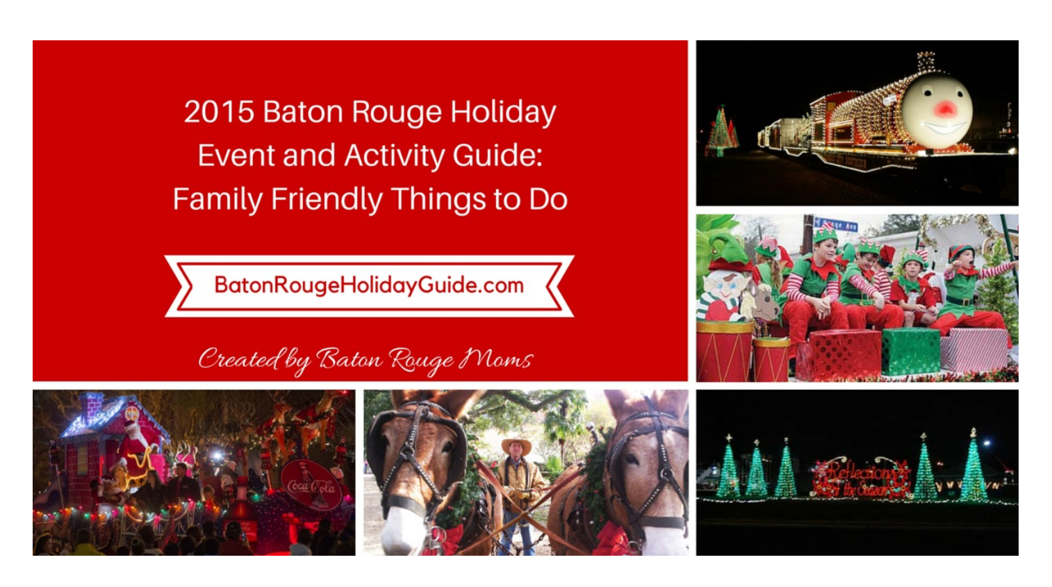
Cortana Kiwanis Christmas Parade

Get your Baton Rouge Holiday Events Guide in PDF form for easy viewing and printing!